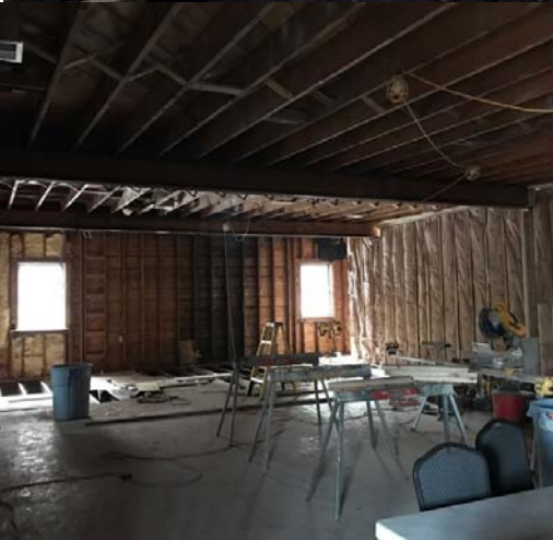
Existing AHSC was gutted by our volunteers at the beginning of this new year.