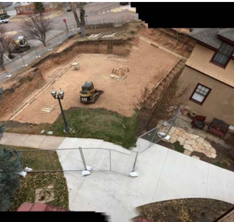
We've come a long way, baby, since ground was broken in early fall after the rezoning delay.

Ron and Dave have framed up the bathrooms and storage room in the existing Alice Hardie Stevens are. Frame ups like this have also happened in the new basement of the addition. Dressing rooms and bathrooms will be located below the stage that sits on the main level on the west side of the expansion. The new basement area will also provide much needed archival and organizational spaces for props and artifacts cared for by the curatorial arm of the museum. These new spaces will be roomier, much drier and more climate-controlled than the basement of the mansion has ever been.