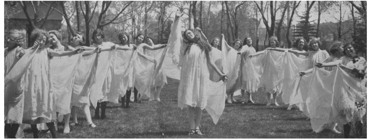
Dancing Queens. Girls from Ivinson Hall perform "The Winds" on the East Lawn. Circa 1920s.

Join us in the Spring when we reopen for tours. The gift shop will be running some excellent specials as we decrease inventory in preparation for the Carriage House Renovation. Stop in for great deals and to say hi! We love when our friends visit.