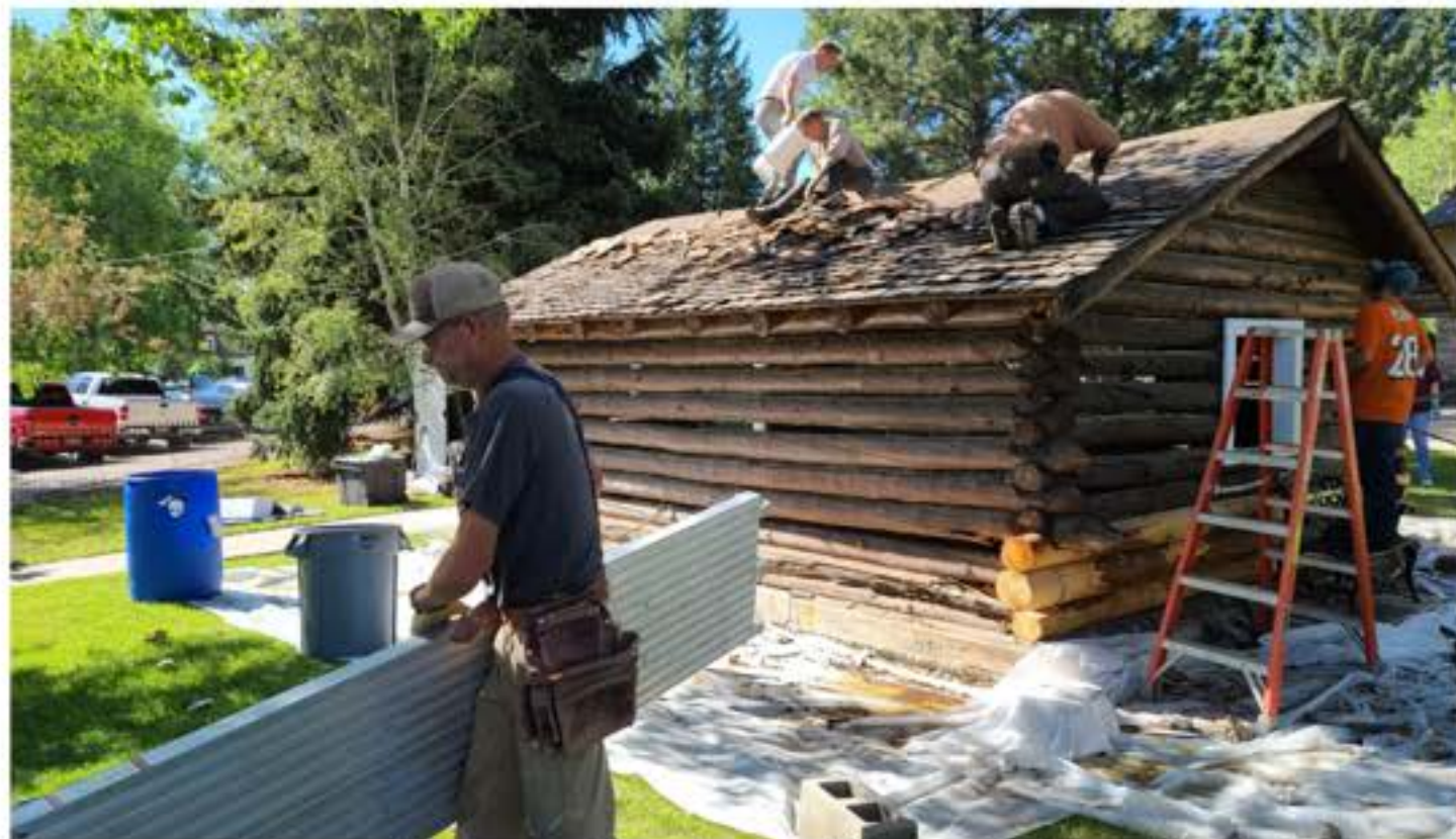
LPM Volunteers and Davis Logworks crew removing old shingles from the Marshall Schoolhouse.