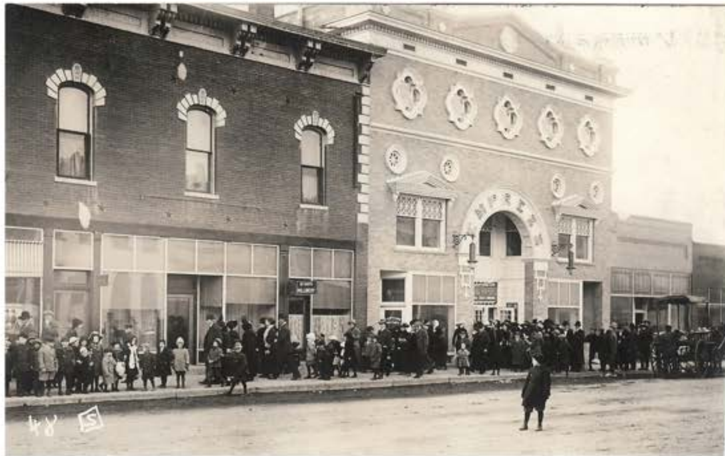
The Empress Theatre formerly located on 2nd. Street.