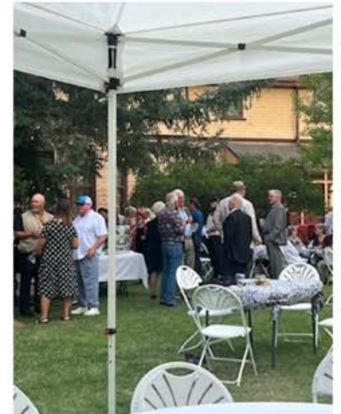
A crowd of stars!