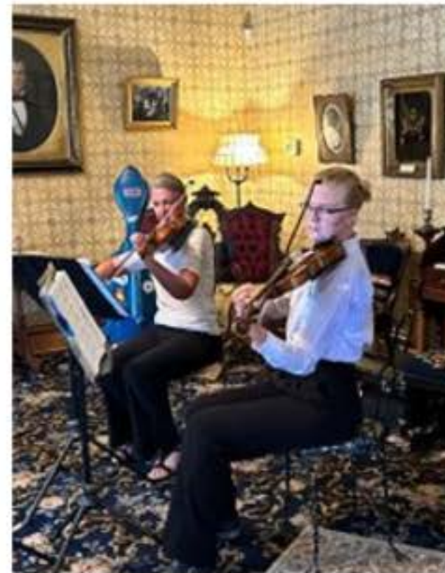
Members of the Cox Family Strings.