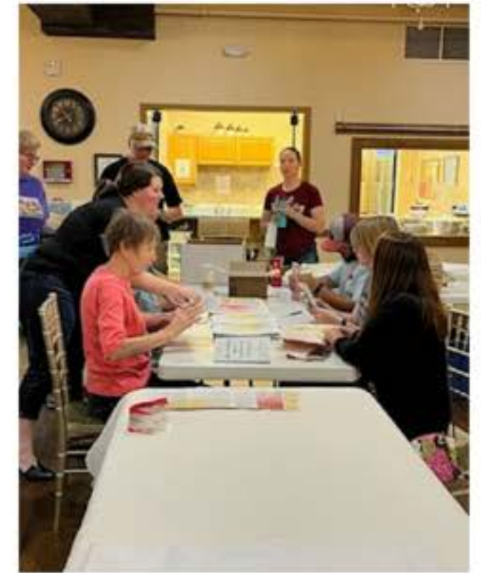
Evening Program folding brigade.

Join us next year for our next "Evening at the Ivinsons," Saturday, August 17th, 2024.